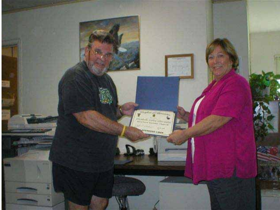
VSO Office - Libby