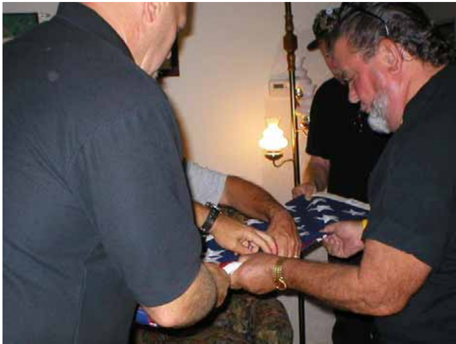
The final folds