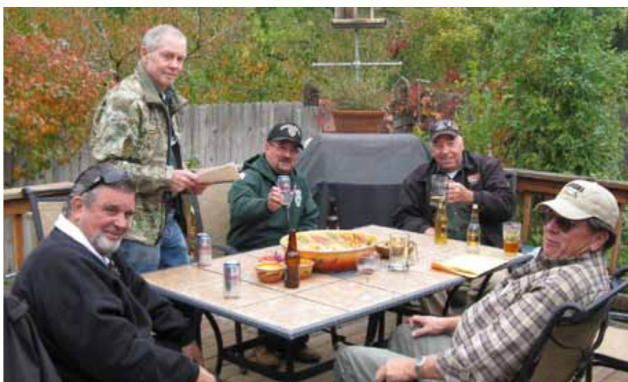
Recount confirmed... Five to one! Keystone ban remains in effect!!