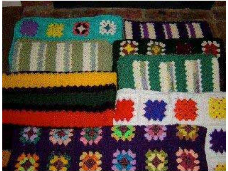
Examples of the "Lap Throws"