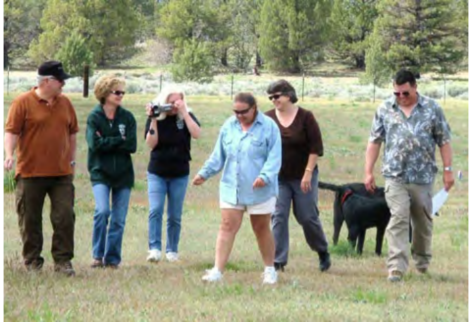
Hmmm? Well...WHAT happens in Montague—STAYS in Montague!