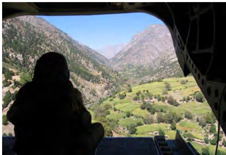
On the job above Kawtina, Afghanistan.