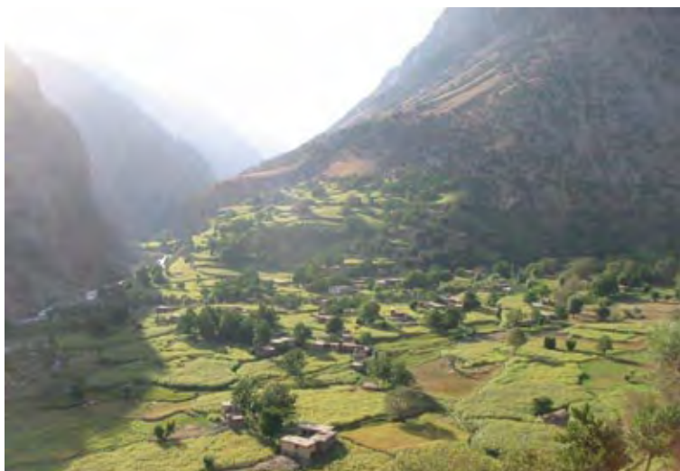
Beauty, even in a hostile environment- Pech Valley, Afghanistan.